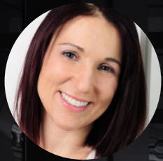
Sally Trivino Forensic Services

Find out how we can best support you! de_store@pwc.com